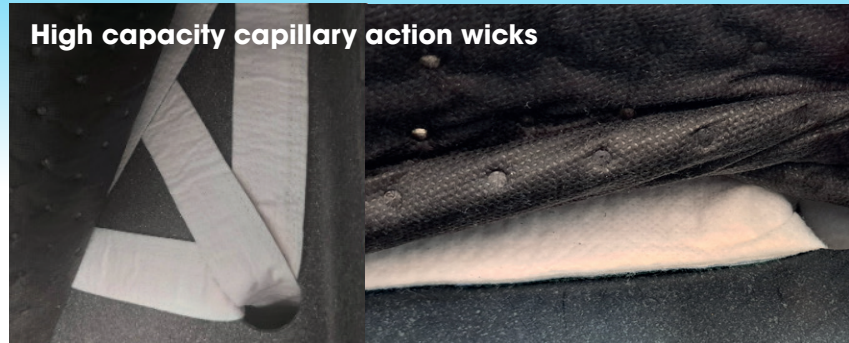
High capacity capillary action wicks

Aquafeed™ helps to save precious water resources and considerable amounts of time and money because unlike traditional baskets, Self-watering Planters do not need watering daily.